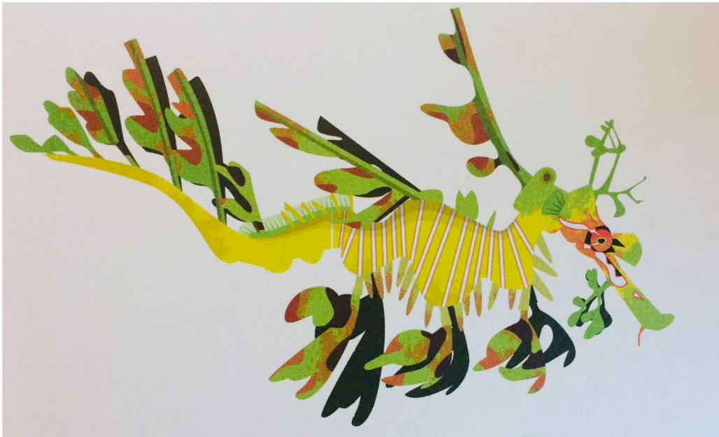
A male weedy seadragon