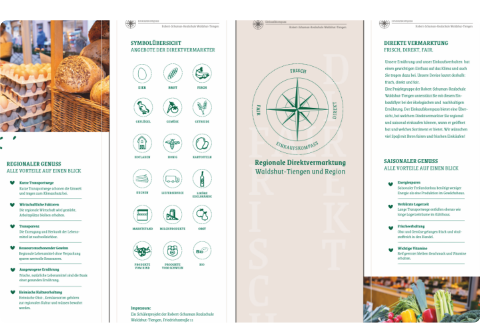
Einkaufskompass, farmers market in Waldshut, made by the Realschule Waldshut