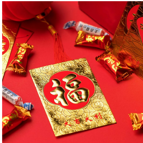
Lunar New Year